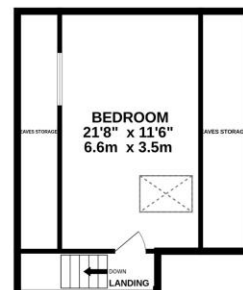
1ST FLOOR 403 sq.ft. (37.4 sq.m.) approx.